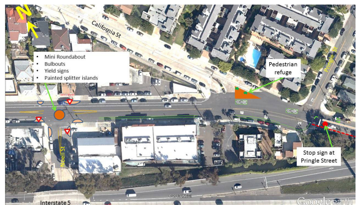
3: Mini-roundabout at Noell St