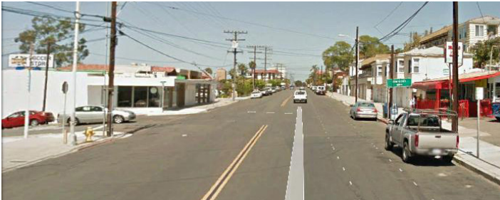
Looking northbound on San Diego Avenue