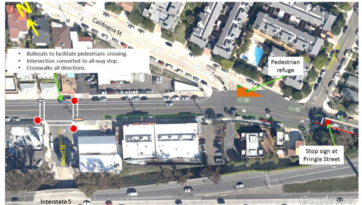
2: All-way Stop with Bulbouts at Noell St