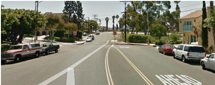
Looking southbound on San Diego Avenue