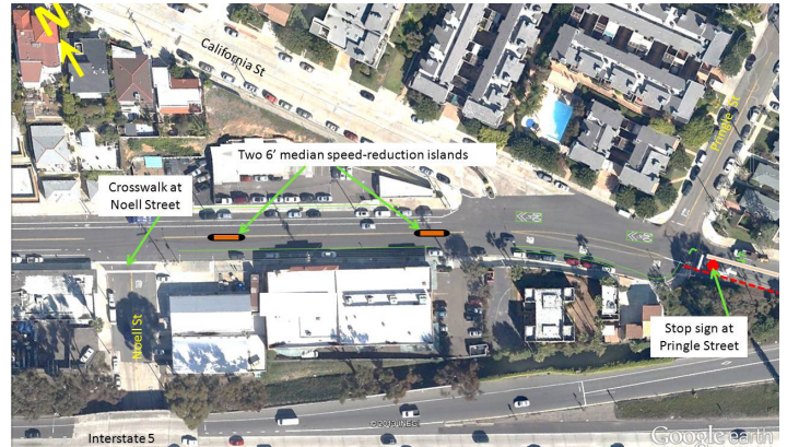
1: Median islands southeast of Noell St