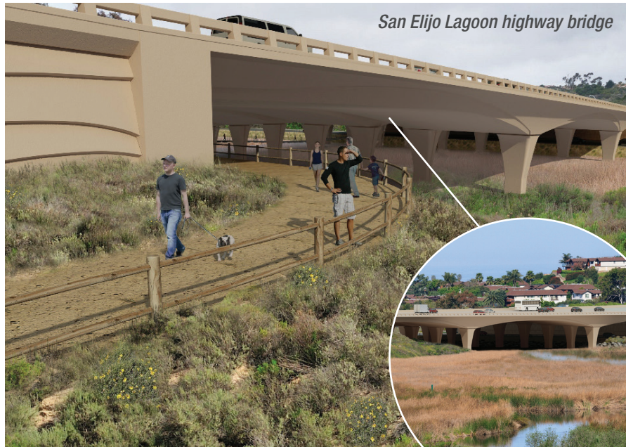
San Elijo Lagoon highway bridge

The San Elijo Lagoon highway bridge will be replaced and lengthened to help improve tidal flow in the lagoon. The wider bridge will accommodate an additional carpool lane in each direction. In addition, a new bike/pedestrian suspended bridge will link the south and north sides of the lagoon, and will connect to a Class 1 bike path on Manchester Avenue, providing access to the San Elijo Lagoon Nature Center.