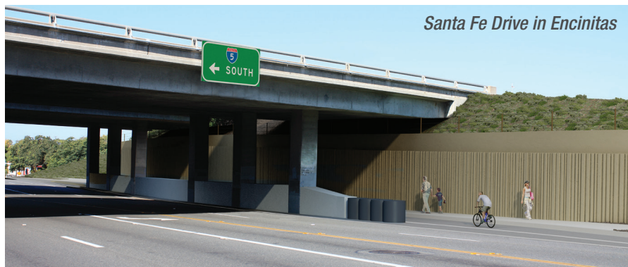
Santa Fe Drive in Encinitas

Build NCC includes local bike/pedestrian path improvements in Encinitas and Carlsbad. The interchanges at Encinitas Boulevard and Santa Fe Drive will be upgraded with new bike and pedestrian paths.