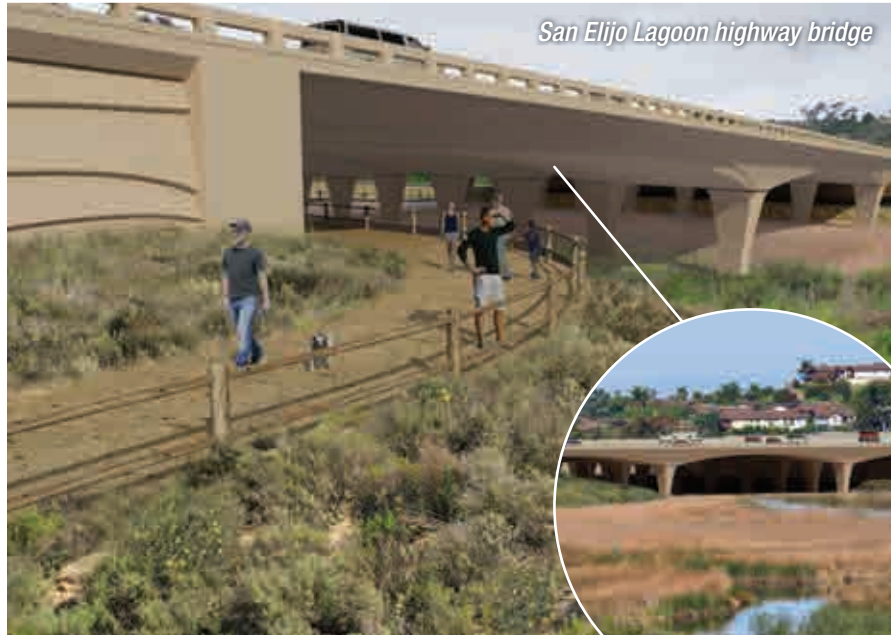
San Elijo Lagoon highway bridge

The San Elijo Lagoon highway bridge will be replaced and lengthened to help improve tidal flow in the lagoon. The wider bridge will accommodate an additional carpool lane in each direction. In addition, a new bike/pedestrian suspended bridge will link the south and north sides of the lagoon, and will connect to a Class 1 bike path on Manchester Avenue, providing access to the San Elijo Lagoon Nature Center.