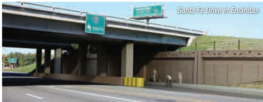
Santa Fe Drive in Encinitas

NCC Phase 1 includes local bike/pedestrian path improvements in Encinitas and Carlsbad. The interchanges at Encinitas Boulevard and Santa Fe Drive will be upgraded with new bike and pedestrian paths. The MacKinnon Avenue/I-5 overpass will be replaced and realigned to provide better bike/pedestrian connectivity to the Encinitas Community Park.