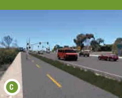
North Coast Bike Trail