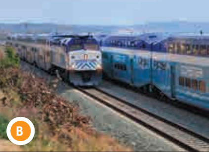
Batiquitos Lagoon and San Elijo Lagoon Double Track