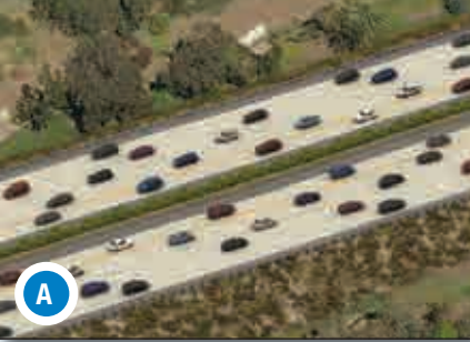
HOV/Carpool Lanes from Lomas Santa Fe Dr. to SR 78