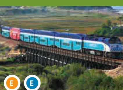
Lagoon Bridge Replacements*