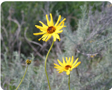
Coast Sunflower: This shrub has a white evergreen foliage color and yellow flowers.