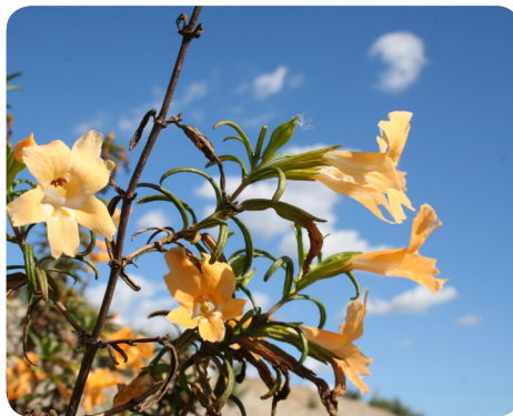
San Diego Monkeyflower: Named for their funny-face-flowers that look like grinning monkeys, these shrubs produce orange flowers.