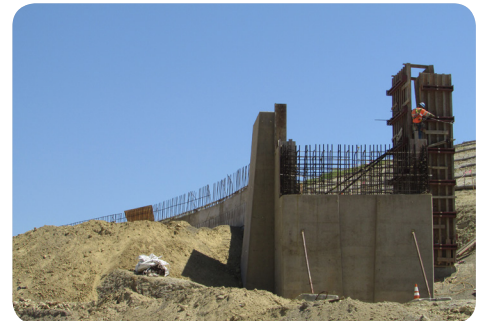
View looking east of the bridge abutment south of Genesee Avenue.

The beginnings of this concrete structure may seem like a mystery, but it is the start of the construction of the bike and pedestrian overcrossing. The construction to build this connecting piece is anticipated to start next summer. This elevated overcrossing will connect the new separate bike path between the Sorrento Valley COASTER Station and Voigt Drive. This unique addition will support the North Coast Corridor bike network and provide alternative transportation choices to encourage more people to #GObyBIKEsd.