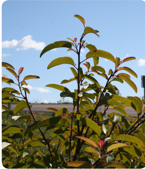
Laurel Sumac: Laurel Sumac is a large evergreen shrub with shiny red-green foliage.