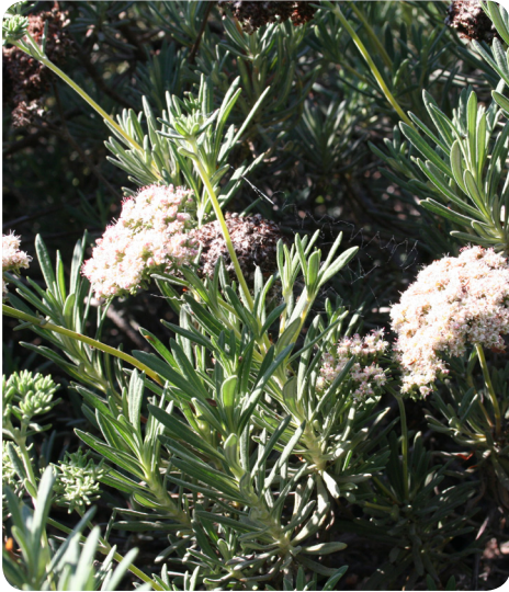
California Buckwheat: Popular in Southern California, this shrub has needle-like evergreen leaves that cover the stems of the shrub and long-lasting cream-colored flowers.

Once the interchange improvements are completed, Caltrans will landscape the area with native, drought-tolerant plants and over 600 trees. Featured here is a sneak peek of some of the colors you may notice in the new landscape. The majority of the new landscape will be irrigated with reclaimed water, aligning with Caltrans' policy on planting and water conservation.