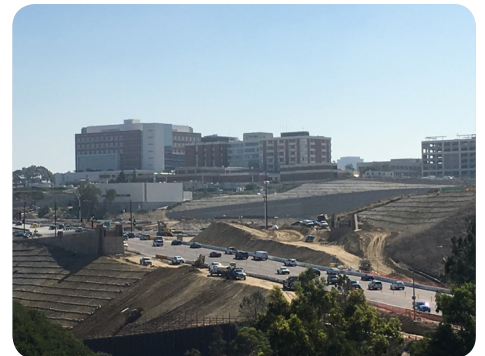
View looking east of the two concrete columns called bridge abutments.