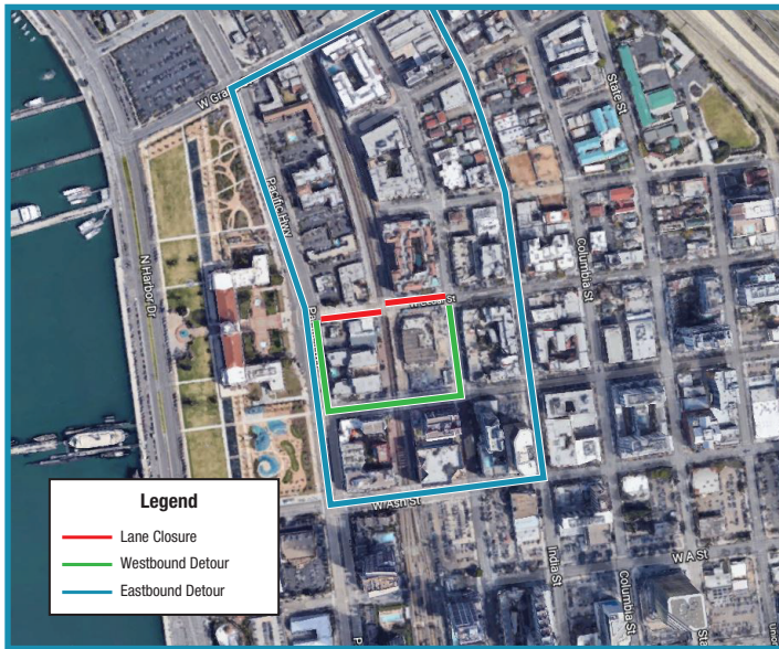
Cedar Street Closure: Early April