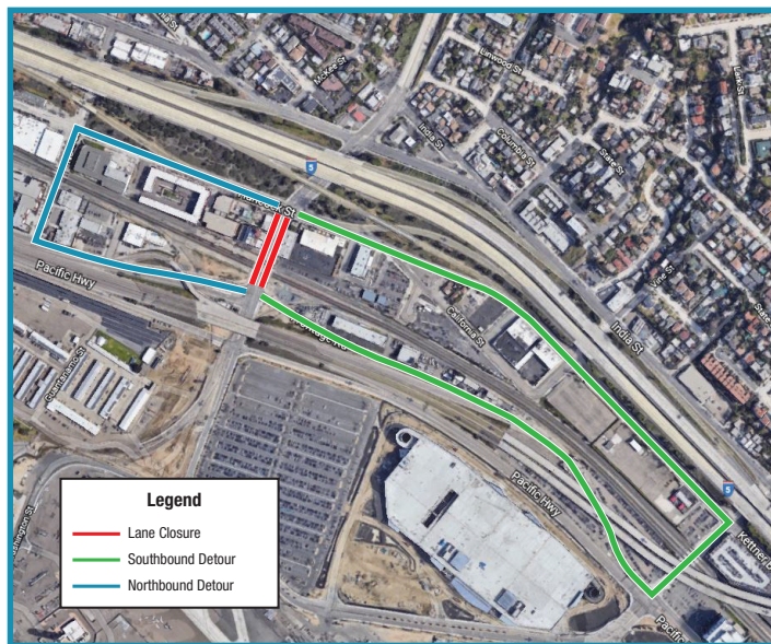
Washington Street Closure: Mid-June to Mid-July