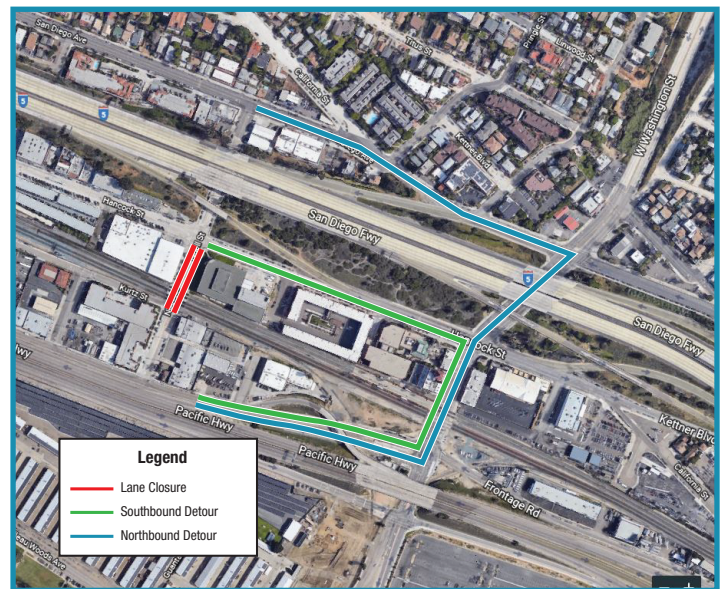
Noell Street Closure: Mid-July to Mid-August