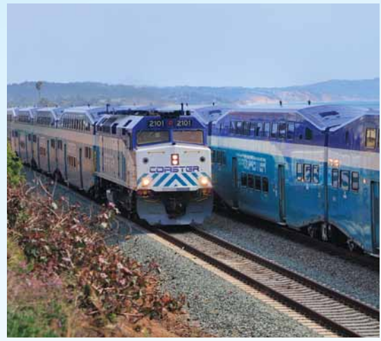
The Project will add 1.1 miles of double track, improving on-time reliability and passenger travel times.

The special events platform will provide a direct connection