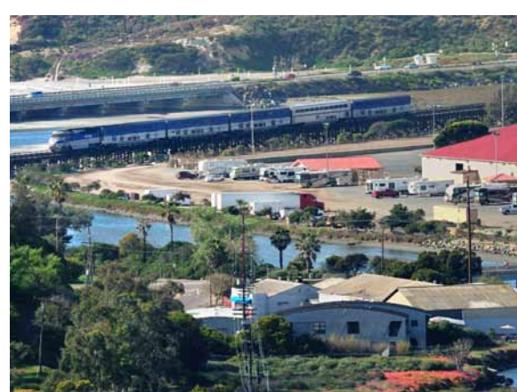
The San Dieguito Double Track and Special Events Platform Project is one of several rail improvement projects planned in the North Coast Corridor.

The project will help achieve the long-term vision of the larger NCC Program, which includes a coordinated package of rail, highway, and transit improvements, as well as significant environmental enhancements, such as habitat acquisitions, lagoon restorations, and a network of bike/pedestrian paths. The project is also consistent with SANDAG's 2050 Regional Transportation Plan, which seeks to improve the transportation system to further enhance quality of life, promote sustainability, and offer more transportation choices for people and goods movement.