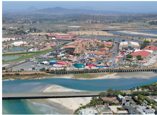
The planned special events platform will accommodate NCTD COASTER and Amtrak Pacific Surfliner passenger trains during special events such as the San Diego County Fair and the horse races.

SANDAG has begun work on preliminary engineering and environmental documents for the San Dieguito Double Track and Special Events Platform Project . The project proposes the construction of a permanent special events rail platform on the west side of the fairgrounds. When completed, the platform will take thousands of cars off I-5, Highway 101, and local streets each event day. The project also