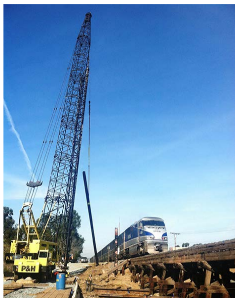
Sorrento to Miramar construction crews worked on the new rail bridge foundation in January 2013.

The first phase of the Sorrento to Miramar Double Track Project will be completed this May. Last year, construction crews were working between Sorrento Valley Station and Miramar Road to build a one-mile stretch of double track. A wooden trestle bridge built in the early 40's was also replaced with a modern concrete rail bridge as part of the project. The project will increase schedule reliability, enhance operational flexibility, increase train capacity, and allow for improved maintenance cycles. Phase 2 of the project, which