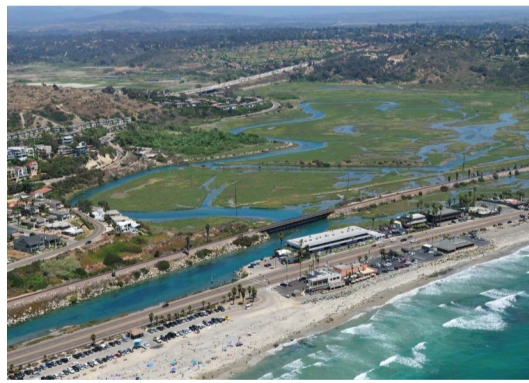
The lagoon's environmental study is being funded through the North Coast Corridor Program and the SANDAG Environmental Mitigation Program.

The San Elijo Lagoon Double Track Project has two main elements. It will add 1.5 miles of second main track from Cardiff-by-the-Sea to the southern border of the San Elijo Lagoon and replace the more than