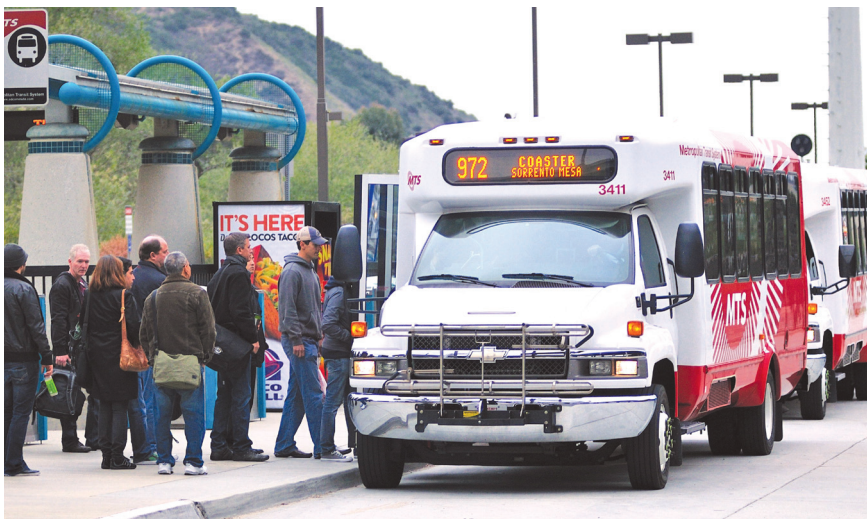
The NCC Transportation Demand Management Plan will explore alternative modes of transportation for the corridor.

The second phase of the project will begin this April and continue through September 2013, and will consist of developing a comprehensive TDM Plan that will help create flexible and cost-effective solutions for travel along the NCC. Companies and individuals interested in learning more about commuting alternatives can find programs and services online at iCommutesd.com .