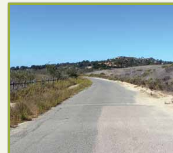
BEFORE: The existing Sorrento Valley bike and pedestrian trail.