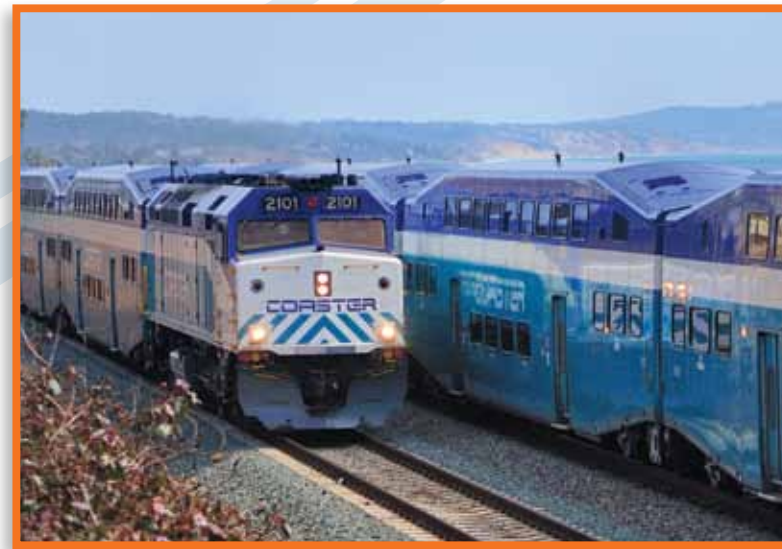
Double tracking is a critical transportation improvement included in the Public Works Plan.

Additional rail enhancements include improving transit station facilities, adding boarding platforms, and increased parking at stations. Planned rail improvements are expected to nearly double current rail passenger capacity. Additional transit improvements include a planned rapid bus service along Highway 101 and main arterials streets from Oceanside to University City. Express Lanes along I-5 also will accommodate Bus Rapid Transit (BRT) service in the corridor. Improvements to the LOSSAN coastal rail corridor, as well as the implementation of new Rapid Bus and BRT services in the NCC, will expand transit options, shorten travel times and ensure on-time reliability for rail and bus passengers.