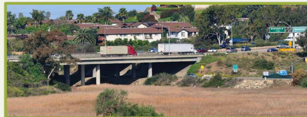
BEFORE: The narrow spans of the current Manchester Avenue bridge inhibit tidal flow and water circulation.

Preserving the natural environment is a critical part of the PWP/TREP. The Resource Enhancement Program (REP) outlined in the plan offers the opportunity to restore and enhance lagoon ecosystems. Through the REP several hundred acres of sensitive coastal habitat will be acquired, preserved and restored. Additionally, the REP will establish an endowment that includes assurances for future maintenance, ensuring the long-term health of these environmental systems.