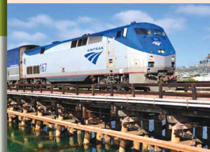
The San Dieguito Double Track rail project will provide direct access to the Del Mar Fairgrounds for COASTER and Amtrak passengers.

The PWP/TREP establishes the North Coast Bike Trail, a contiguous bike and pedestrian trail that will run parallel to I-5 from northern San Diego to Oceanside. It also outlines opportunities to fill gaps in the region's existing bike and pedestrian network including creating new east-west regional bike and pedestrian trail connections. These bike and pedestrian improvements would offer direct routes to transit and employment centers and enhance public access to the region's beaches and recreation areas.