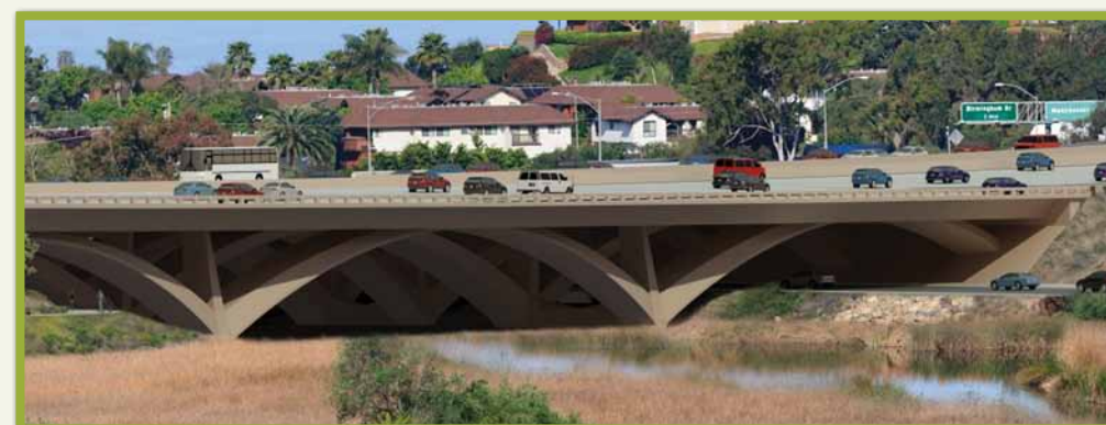
AFTER: The future Manchester Avenue bridge will be lengthened to allow for optimal tidal flow and water circulation, enhancing the overall health of the lagoon.

Through the PWP/TREP process, Caltrans identified opportunities to improve tidal flow and the overall health of the six lagoons in the NCC. It was found that by lengthening existing highway and rail bridges, tidal flow and water quality would be improved by creating wider openings for improved water circulation and facilitating large-scale restoration plans in the San Elijo, Batiqitos and Buena Vista Lagoons.