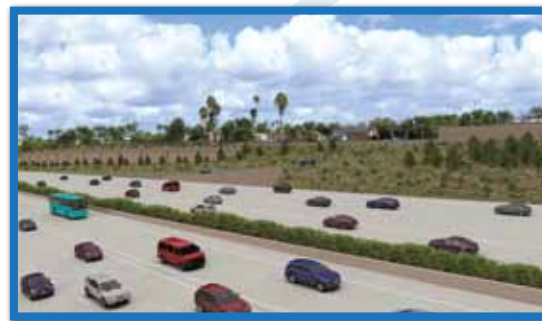
The I-5 Express Lanes will help improve mobility and reduce travel times in the North Coast Corridor.