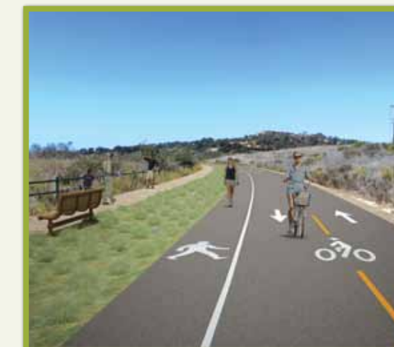
AFTER: The Public Works Plan provides opportunities to restore trails as shown above.