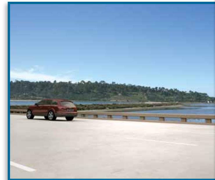
Views of the San Dieguito Lagoon and other coastal resources will be preserved.

The PWP/TREP ensures that highway, rail and transit, environmental, and coastal access improvements protect scenic views along the corridor in accordance with the California Coastal Act. Examples include see-through bridge rails, transparent sound walls for private properties and additional scenic viewpoints.