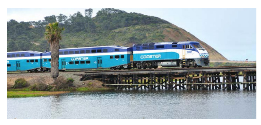
A COASTER passenger train crosses a wooden trestle bridge constructed in 1911.

The project will cost $31 million and construction will take approximately two years.