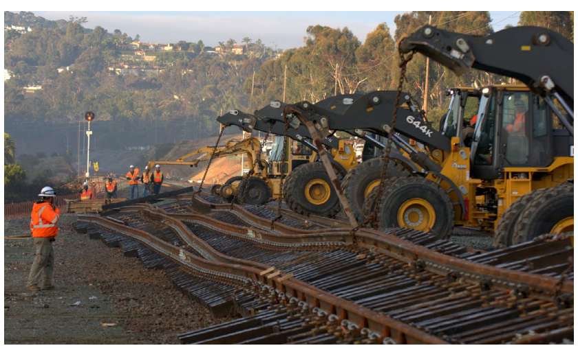
Crews move a new railroad crossover into place.

Since work began in August 2015, crews have completed six AWWs at the Control Point (CP) Rose Track Crossovers Project site, located at the railroad tracks where Regents Road ends.