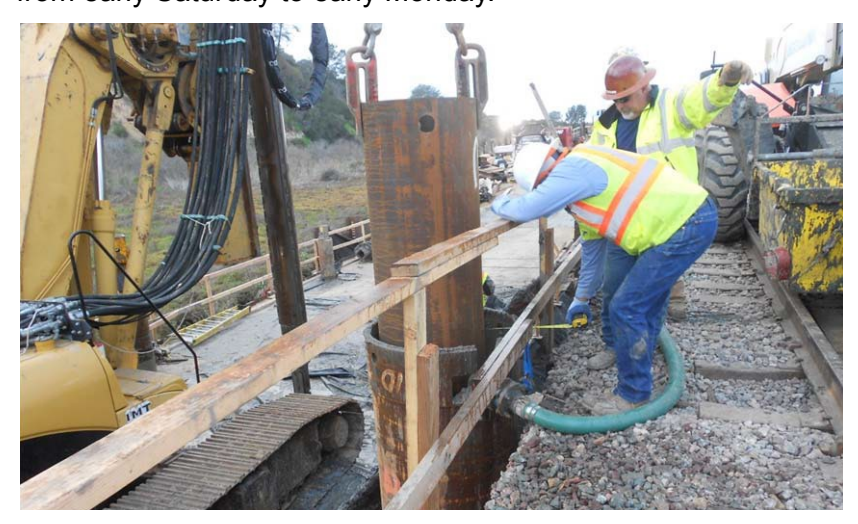
Crews work to place support columns on a center bridge.

Construction crews made significant progress on the Los Peñasquitos Lagoon Bridges Replacement Project last month. As a result of the January weekend rail closures, or Absolute Work Windows (AWWs), SANDAG completed the remainder of the support columns on the northernmost bridge. The benefit of weekend rail closures is crews are able to meet construction milestones by working unimpeded while all rail services are halted from early Saturday to early Monday.