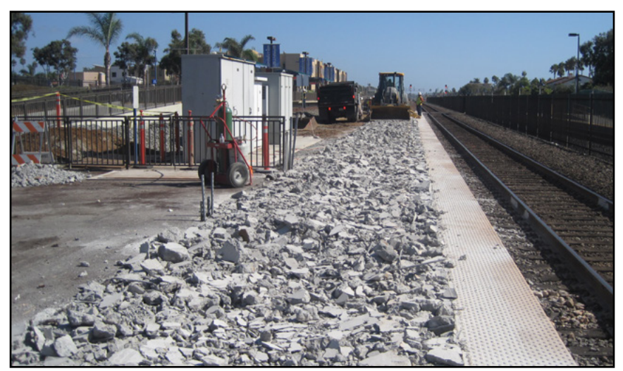
Crews will be completing the demolition of Platform 1 this weekend.

Crews are making great progress on the <u>Oceanside Transit</u> <u>Center Platform Improvement Project</u> and will be completing the demolition of the southern end of Platform 1, the existing easternmost platform at the station. Anticipated AWW work also includes the installation of a new crossover just south of the station between Eucalyptus Street and Oceanside Boulevard, and other track work in the project area.