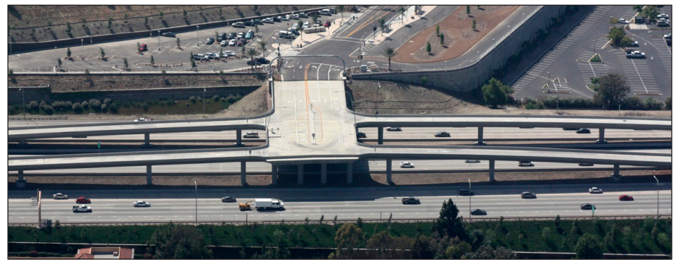
Direct Access Ramp at the Rancho Bernardo Transit Station

The Interstate 15 (I-15) Express Lanes provide a four-lane, 20-mile Express Lane facility in the median of I-15 stretching from State Route 163 (SR 163) north to State Route 78 (SR 78). The I-15 Express Lanes are the first adaptable, high-tech transportation facility configured to meet the diverse needs of local travelers, commuters and commerce in the San Diego region. The new Express Lanes are available for free to transit, carpools, vanpools, motorcycles, and permitted clean air vehicles. For a fee, single occupant vehicles can also travel on the Express Lanes using the FasTrak® electronic tolling system. Additionally, a new Bus Rapid Transit (BRT) service, called Rapid , began in June 2014 and provides high frequency transit service on the Express Lanes.