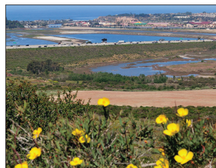
The PWP/TREP will protect and enhance the North Coast Corridor coastal habitat.

For more information on the North Coast Corridor Program, please visit KeepSanDiegoMoving.com .