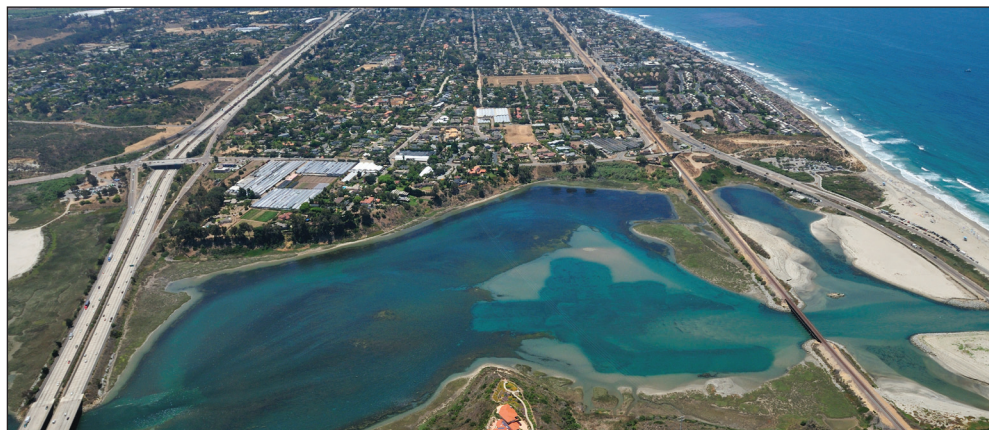
The I-5 and LOSSAN rail line in North County traverses through scenic and unique natural environments.

The San Diego Association of Governments (SANDAG) and the California Department of Transportation (Caltrans) have developed the PWP/TREP, which is the result of more than 10 years of collaboration and public input. The PWP/TREP provides an implementation blueprint for a $6.5 billion, 40-year program of rail, highway, environmental and coastal access improvements, the majority of which have been contained in previously-adopted regional and city plans. The PWP/TREP is a single, integrated regulatory document that will be considered by the California Coastal Commission in an effort to streamline project review that could otherwise require multiple coastal development permits.