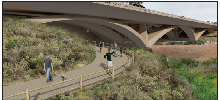
The PWP/TREP will improve east-west connectivity across I-5 to facilitate coastal access.