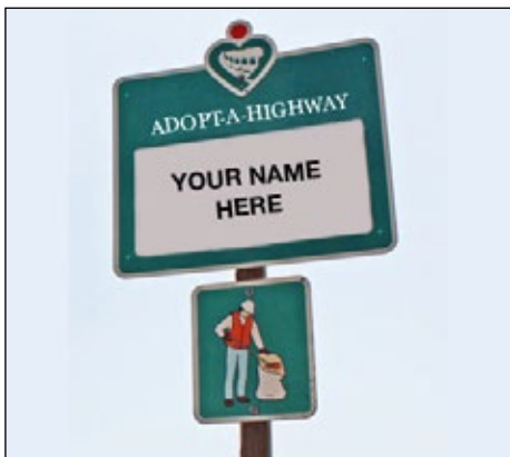
Adopt a ramp in your community

Many ramps along the recently completed I-15 Express Lanes could be yours to adopt through Caltrans' Adopt-A-Highway program.