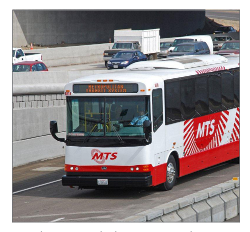
Rapid Express Vehicle running on the I-15 Express Lanes

Del Lago and Rancho Bernardo Transit Stations : Improvements at these stations included adding bus bays and new shelters, as well as installing next vehicle signs to provide updated bus arrival times. Construction began in August 2012 and was completed in March 2013.