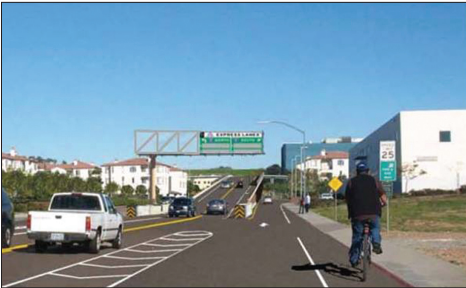
Simulation of the new entrance from Hillery Drive to the Mira Mesa DAR

In Summer 2012, construction began in order to improve travel choices and transit services in the Mira Mesa community. The project will build the new Miramar College Transit Station and Mira Mesa Direct Access Ramp (DAR) connecting Hillery Drive in Mira Mesa to the I-15 Express Lanes.