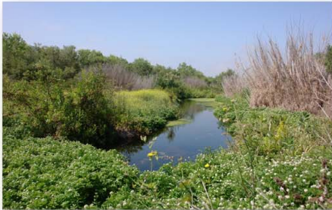
Morrison Property, San Luis Rey

Ownership: Caltrans Management: Caltrans Conservation Easement to SANDAG: No Native Habitat Restoration Proposed: Yes