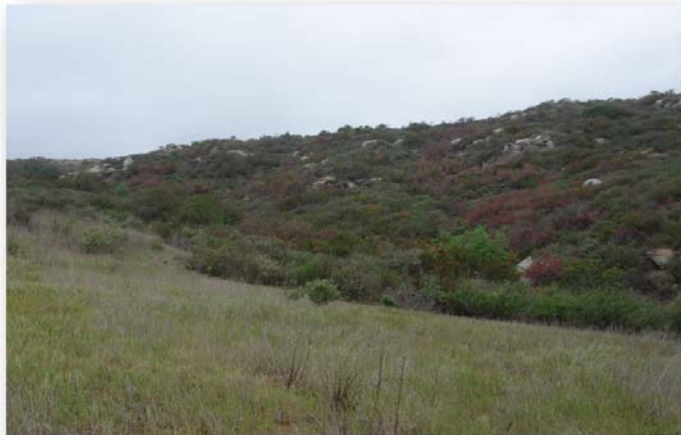
Groves Property, San Luis Rey

Ownership: Caltrans Management: Caltrans Conservation Easement to SANDAG: No Native Habitat Restoration Proposed: Yes