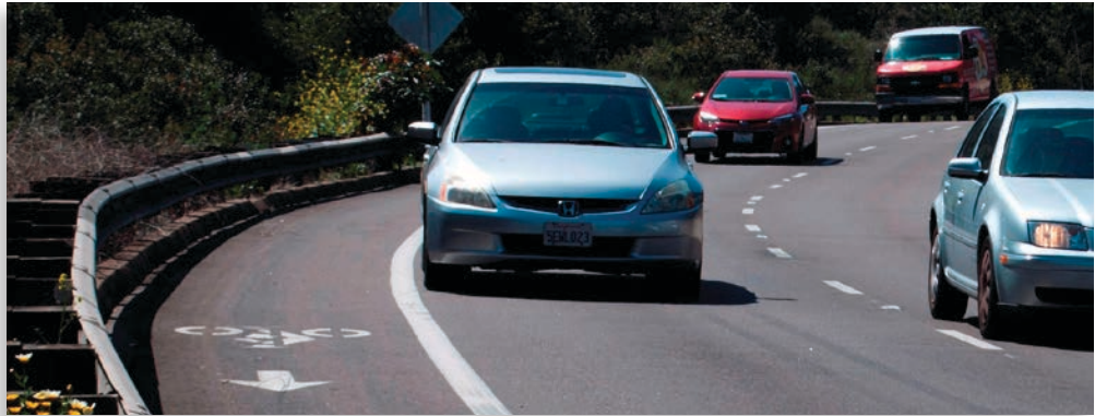
Texas Street - Looking south at northbound Texas Street near Camino del Rio South.